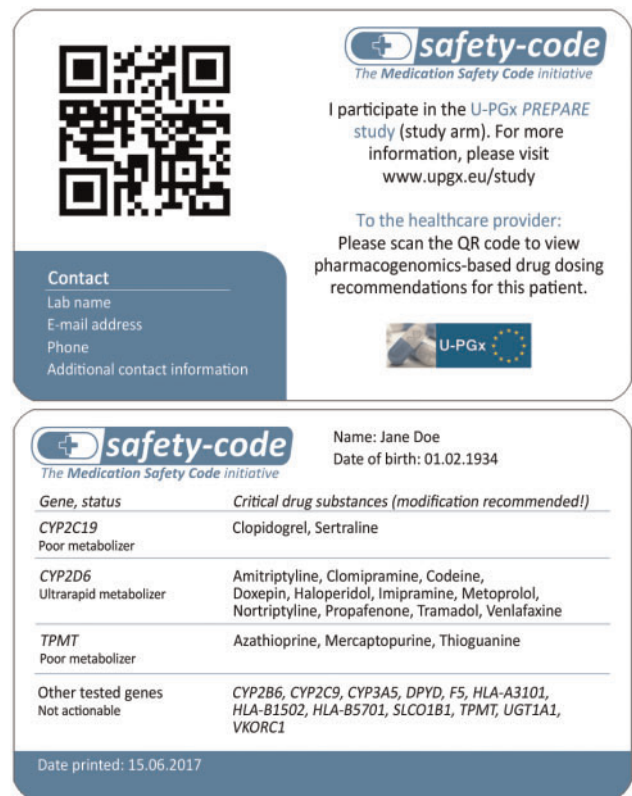
Figure 3. Front and back side of an exemplary Safety-Code card for a fictional patient recruited in the U-PGx project

While a final reflection and assessment of our implementation efforts can only be conducted after completion of the project, we nevertheless want to share the most important experiences collected over the course of this initial project phase.